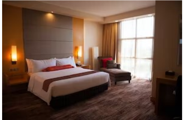
Premier King (1 King Bed)

The Waterfront Hotel An Artrageous Hotel