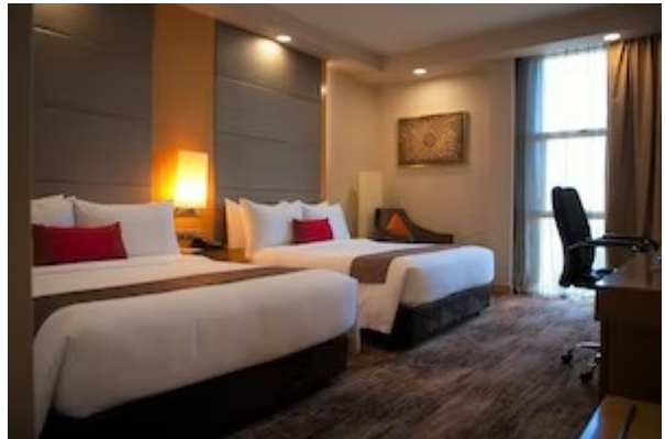
Premier Family (2 Queen Beds)