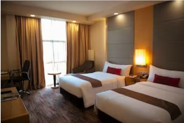
Premier Twin (2 Single Beds)