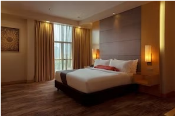
Premier King Suite (1 King Bed)